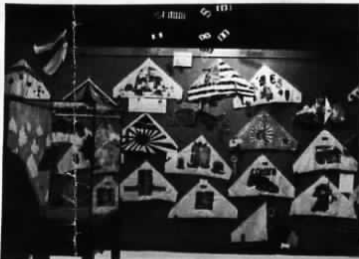
The Oriental miniature kites display with the children's kites in the background and Harold Writer's miniature box kite mobile, top center, at the Pacific Science Center.