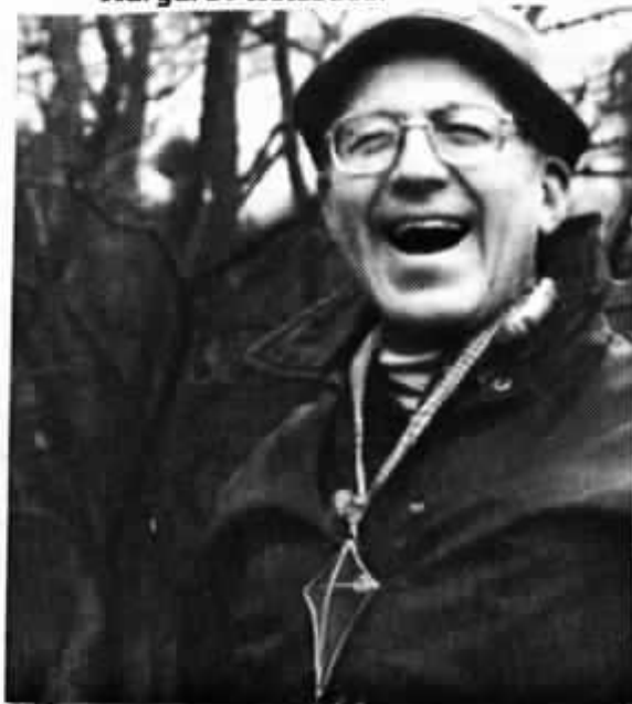
Our fearless Leader!

Some people think that kites are for kids. We can assure you that this is not true. But if you will, consider this: Kites are for the kid in you.