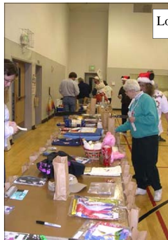
Lotsa raffle items to win, ooohhh