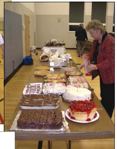
Lotsa food to eat—YUM!